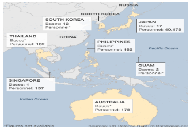
United States Military Bases in Asia Pacific 44

As pointed out earlier on, Pentagon is placing more troops in the region more than at any time since the WW-II. With immediate effect, Australia will host a deployment of over 200 US marines which would eventually go up to 2,500 which is called Amphibious Readiness Group (ARG). From another perspective, Washington also takes into account other regional players like India, a rising power, Japan’s growing assertiveness, Russia’s increasing activism in the Asian affairs, and Indonesia’s return in politics. 43