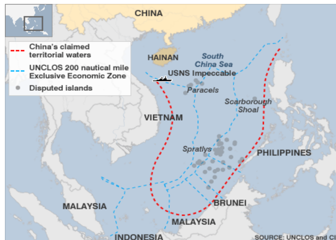
Source: UNCLOS and CIA 14