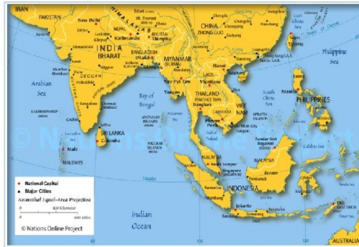
Map of South East Asia 11

Pacific by 2050 wherein three of the world's four biggest economies will be China, Japan and India. 10