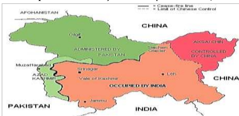
Map-1: Indian Boundary to Launch Operations in IIOJK